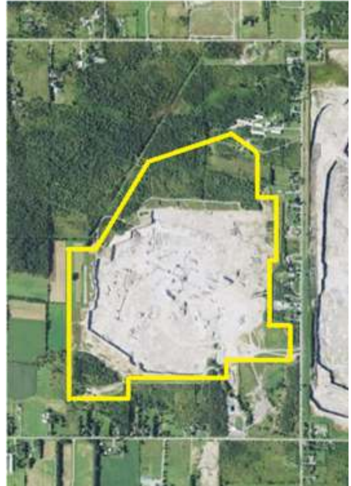
Approved Extraction Limit shown in yellow